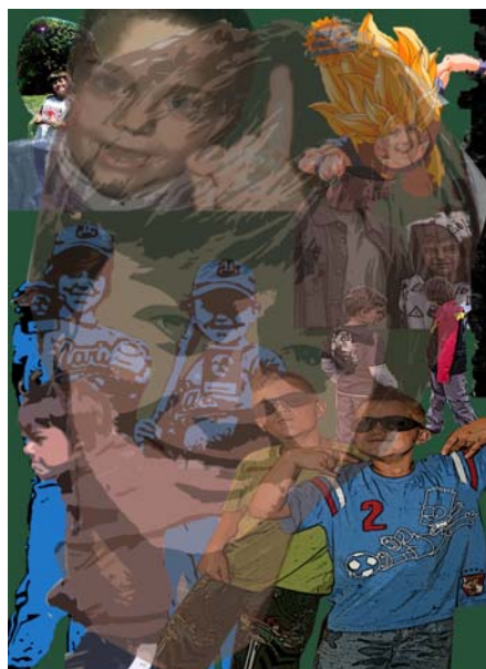
Digital Art - See More Information in NL 2

We ask that parents/caregivers advise the school of their child's absence or lateness by 8.30a.m. This enables classroom teachers to be advised before school commences.