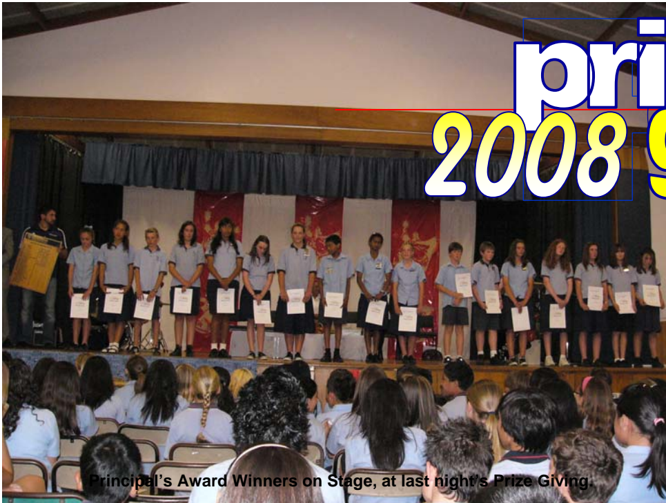
Principal's Award Winners on Stage, at last night's Prize Giving.

Thank you to all the parents/caregivers who attended last night's Prize Giving. It was an extremely successful event, highlighting the success and achievement of our students and the professionalism of our Staff.